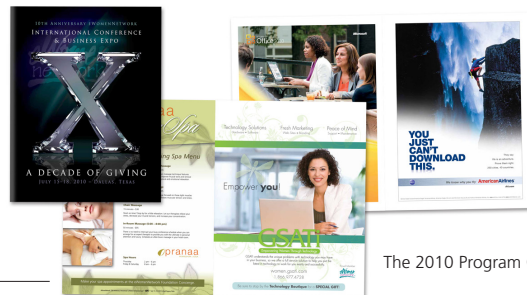
The 2010 Program Guide

Please carefully read the ad specifications on page 2 to ensure that we are able to reproduce your ad in the 2012 Program Guide.